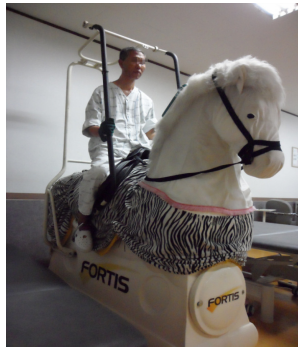
[Fig. 1] Horse-riding simulator