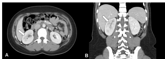
Fig. 2. Pyelonephritis exhibited on the right kidney, but subcutaneous emphysema was absorbed from the axial view (A) and coronal view (B) on CT after 5 days

Furthermore, we consulted the radiology department to determine the presence of a puncture wound in the peritoneal wall and kidney injury by needle. A radiologist confirmed abdominal myositis and acute pyelonephritis. We opted for medical treatment without surgery and performed an abdominal CT scan as a follow-up after 5 days. The carbon dioxide gas was absorbed and myositis was improved, but the area of low attenuation on the right kidney was unchanged (Fig. 2A and 2B). We stopped antibiotic treatment 7 days later and recommended discharge from the hospital as the blood and urine cultures were negative, laboratory tests were normal, and symptoms were improved.