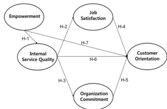
Fig 1. Conceptual model

A conceptual model with five variables is suggested as below in Fig 1.