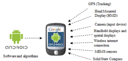
[Fig. 1] Augmented reality on android platform

As the economic realities of education change and today's student becomes ever more sophisticated, the platforms used for teaching students must evolve to remain effective.