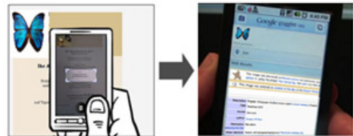
[Fig. 3] Matching image after capturing

Augmented Reality (AR) is going to be the future of most apps; all it takes is a decent processor, a camera, a compass and a GPS, all of which are becoming increasingly common on smart phones. In this paper, we proposed Augmented Reality for Species Identification using Android Smartphone with augmented reality in species determination. This study is appropriate in the field of Biology.