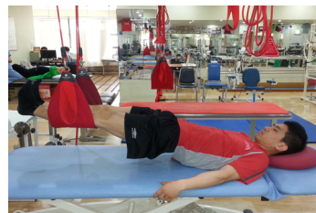
(d) Cross bridge