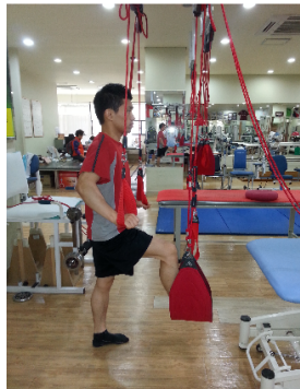
(e) Sling leg press