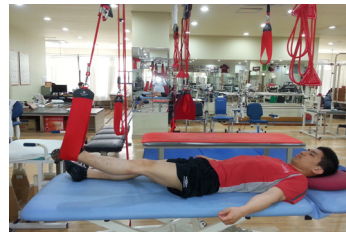
(b) Hip extension