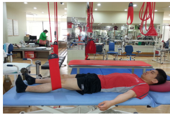
(a) Knee extension

Subjects trained for quadriceps femoris, hamstring, gluteus maximus, erector spine, adductor with sling of 3 times a week which strength muscle without risk and chronic fatigue [17]. According to exercise prescription principle for progressive resistance, the exercise program was set with individually modified, intensity was set with rating perceived exertion. Exercise program was set as 10 seconds for maintain posture, 10 seconds for resting time between exercise set, 60 seconds for movement resting time [Table 2][Fig. 1].